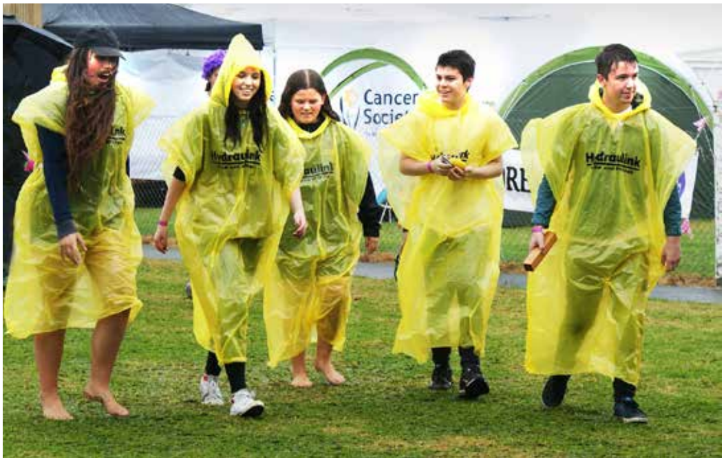
Relay for Life: Students getting wet while getting out there in the track.