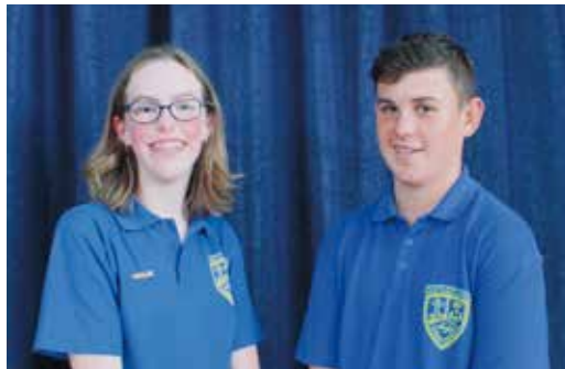
Kaupokonui Cup and Mary Pohutukawa Award Top in Year 9 subjects