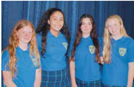
Phillips Cup and Mary Pohutukawa Award Top in Year 10 subjects

Congratulations to all students that received awards and recognition for their commitment and hard work during the year. Well done.