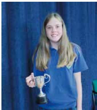
Clement Cup Junior Boys' Athletics Champion